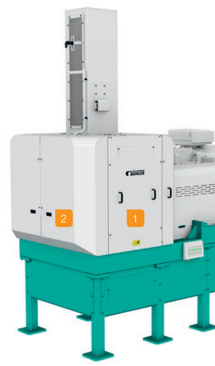
PesaMill™ offers maximum quality and flexibility in the production of high-quality flour varieties.