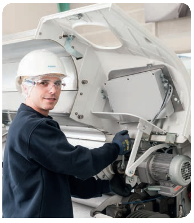
Bühler Service: Ready for service around the world and around the clock

Bühler offers both individualized services, as well as comprehensive, total service packages, to ensure smooth operation of the PesaMill™. Over 1000 highly trained service technicians, in over 140 countries, offer onsite advice and support, including customized maintenance contracts, fast repairs and support services, as well as innovative retrofits.