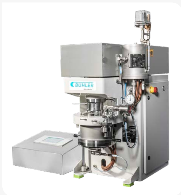
Available for Advantis, Cosmo and SuperFlow