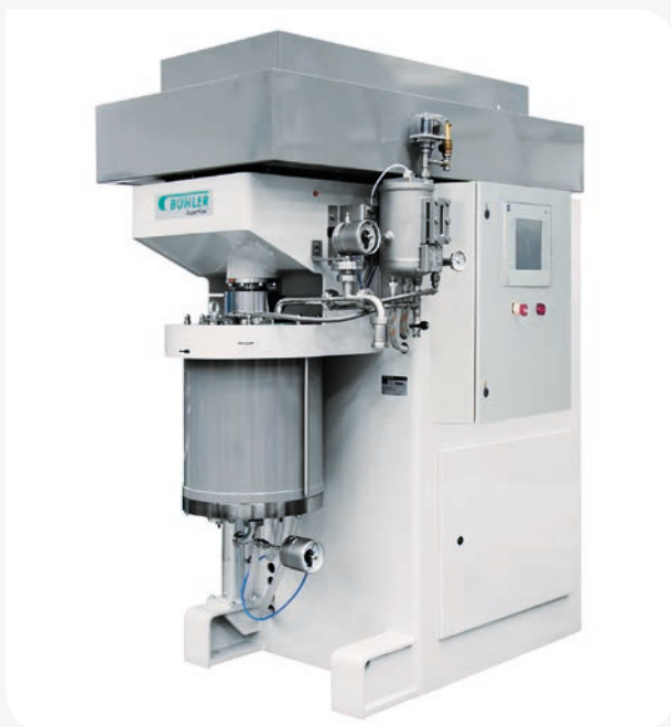
Available for Advantis, SuperFlow, DCP