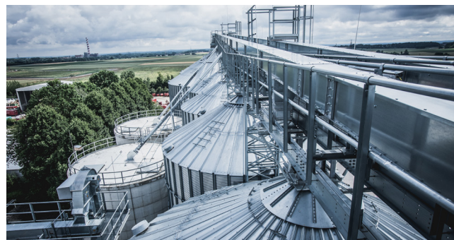
Storage systems Silos, Warehouses & Co. Eat without hesitation!