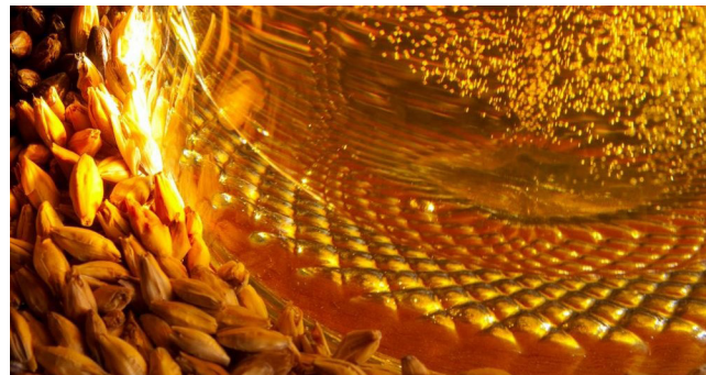
Malting & Brewing Everything about beer