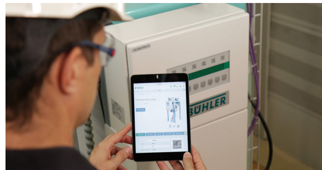
Controlling & apps myBühler, DryMate, ProPlant