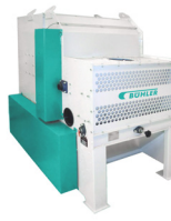
Air cleaner LAIA