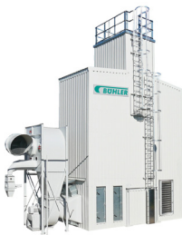
Dryer EcoDry, EcoClean, EcoCool