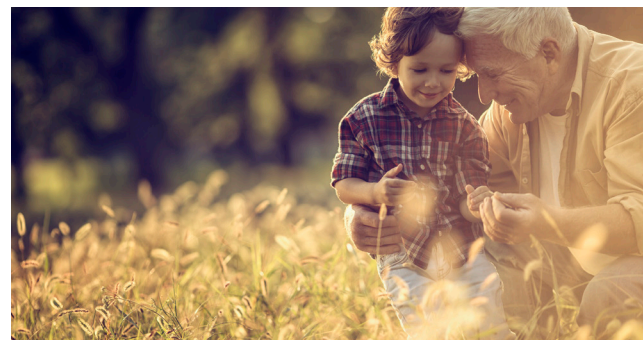
Cereal basics From A - Z myBühler, DryMate, ProPlant