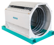
Drumsieve LAKA, RCDA, MKZM