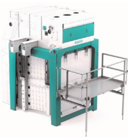
TAS / SMA / GrainPlus LAAB / LACB / LAGA

Which components would you like to know more? Mark the relevant boxes and your training will be customized.