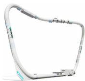
TUBO, tubular push conveyor LBGA