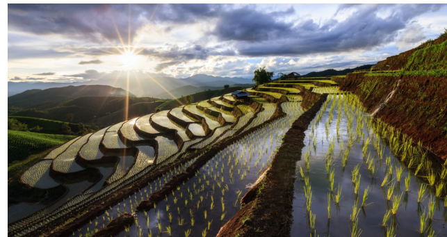
Rice solutions From field to fork