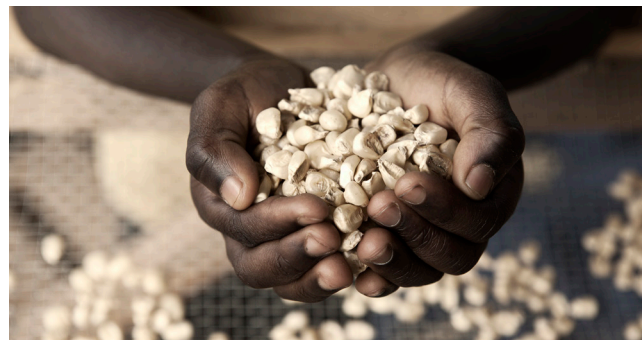
Food safety Eat without hesitation!