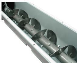
Screw conveyor NFAT, MNSH