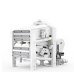
Vitaris combicleaner MTKC. + Air-recycling aspiration channel MVSS.