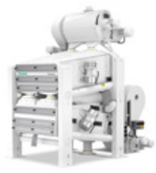
Vitaris combicleaner MTKC. + Air-recycling aspirator MVST. + Air-recycling aspiration channel MVSS.