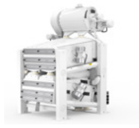
Vitaris combicleaner MTKC. + Air-recycling aspirator MVST.