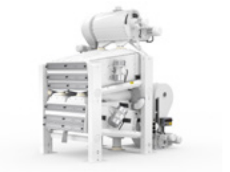
Vitaris combicleaner MTKC. + Air-recycling aspirator MVST. + Air-recycling aspiration channel MVSS.