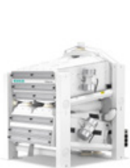
Vitaris combicleaner MTKC.