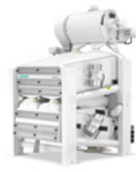
Vitaris combicleaner MTKC. + Air-recycling aspirator MVST.