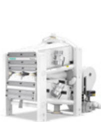
Vitaris combicleaner MTKC. + Air-recycling aspiration channel MVSS.