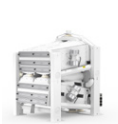
Vitaris combicleaner MTKC.