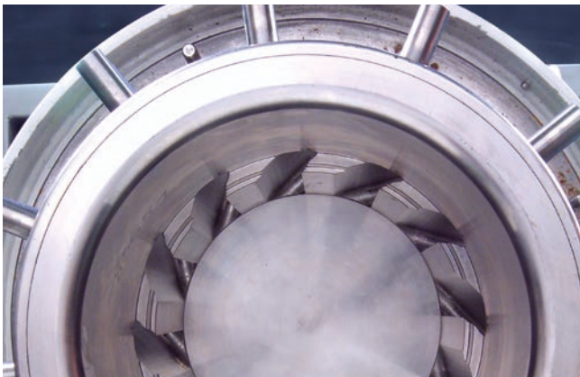
View inside the MicroMedia X process chamber

With this conversion kit, Bühler makes it possible to benefit from the process engineering advantages of the MicroMedia X, even for older machine systems (Advantis, Cosmo, SuperFlow, DCP and Viscoflow). For this purpose, an individual conversion package is put together that reduces conversion costs to