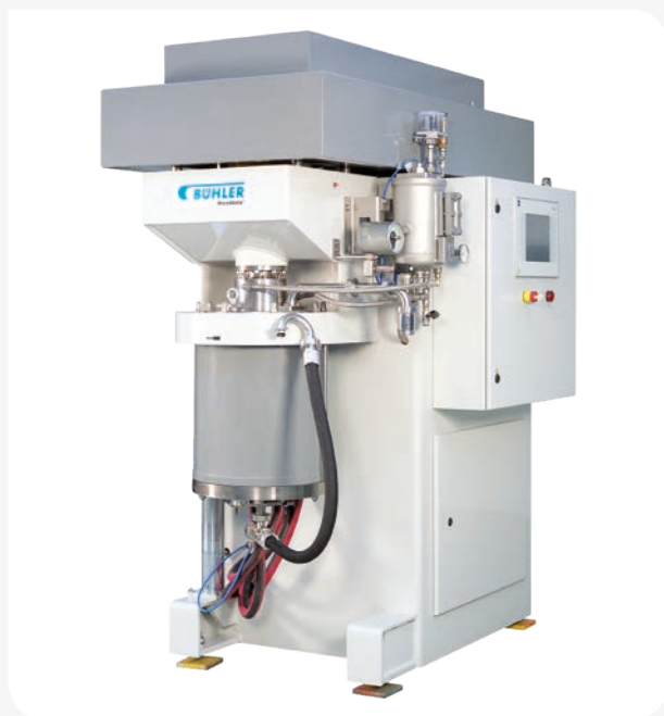
Available for Advantis, Cosmo, SuperFlow, DCP and Viscoflow