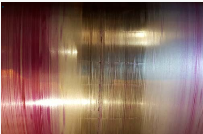
The rolls must be reground.