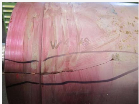
The jacket must be replaced.