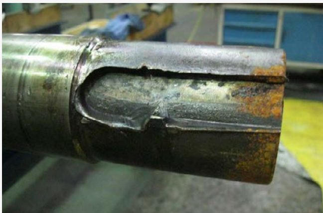
The leg must be replaced.