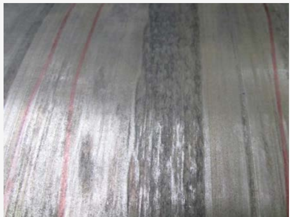
The jacket must be replaced.

If you have any questions regarding this offering or about our services, please send an e-mail to: cs.gd@buhlergroup.com