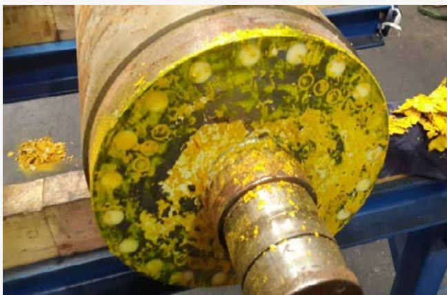
Unclean rolls lead to extra costs. Please ship cleaned rolls only.