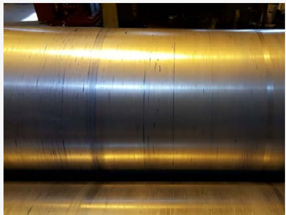
The rolls must be reground